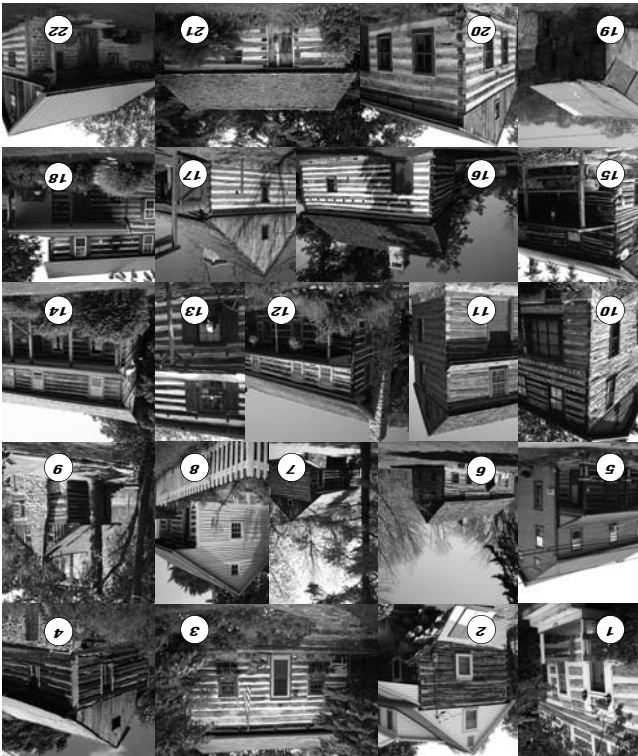
Some parts of the Lehigh County Log Cabin Trail, in the Central Section, are routed along part of our county's delightful covered bridge tour which adds further historic charm and educational value as one explores the log cabin trail.

It is an important and fascinating new resource which teachers can use to expose students at all educational levels to log buildings and learn about the roles they played (and still play in some cases) in our history.